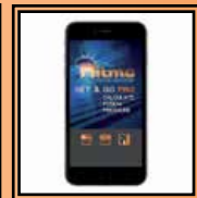
App "Set & Go Pro"

and: Inserts Ø 8" ÷ 24" IPS; 8" ÷ 20" DIPS; KIT for IN-DITCH USE, HS Roller 630, KIT hoist, metal cage for transport