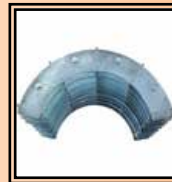
Inserts Ø 225 ÷ 630 mm