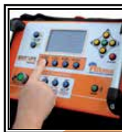
Control panel with GPS