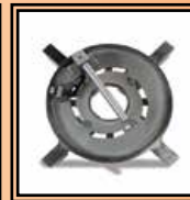
Tool for flange necks