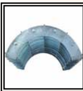
Inserts Ø 225 ÷ 630 mm