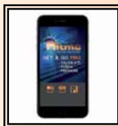
App "Set & Go Pro"