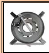
Tool for flange necks