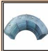
Inserts Ø 200 ÷ 500 mm