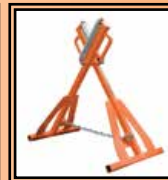
HS Rollers 630