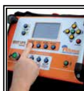
Control panel with GPS