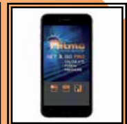
App "Set & Go Pro"

and: Inserts Ø 6" ÷ 18" IPS; 6" ÷ 18" DIPS; KIT for IN-DITCH USE