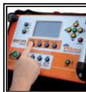
Control panel with GPS