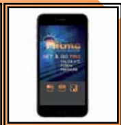
App "Set & Go Pro"

and: Inserts Ø 6" ÷ 18" IPS; 6" ÷ 18" DIPS; KIT for IN-DITCH USE, HS Roller 630; Plug for network power supply connection