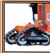
Track Conversion System