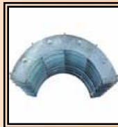
Inserts Ø 200 ÷ 500 mm