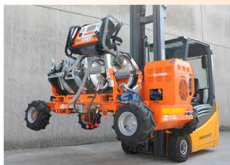
Delta 355 All Terrain lifting