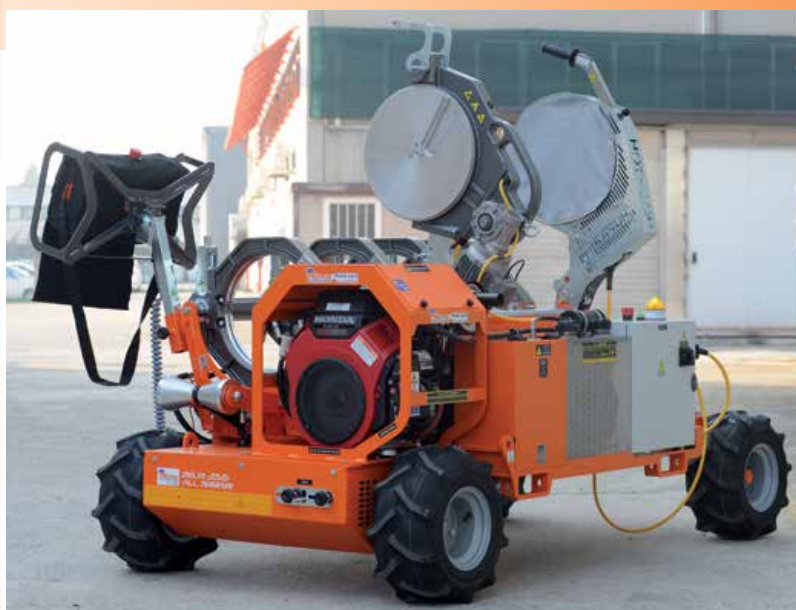
Gasoline or Diesel generator available

DELTA 355 TRAILER welds HDPE, PP pipes and fittings for the transportation of gas, water and other fluids under pressure from 125 mm to 355 mm (from 4" IPS to 14" IPS). DELTA 355 TRAILER does not have an on board generator and needs external power supply; no traction.