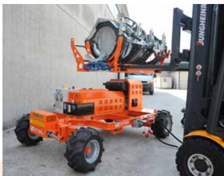
Only machine body lifting