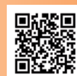
watch the video