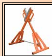
HS roller 630