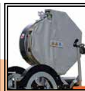
Hydraulic Heating plate