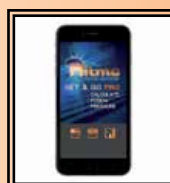
App "Set & Go Pro"