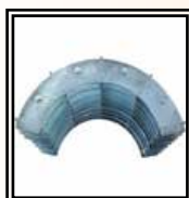
Inserts Ø355÷900 mm