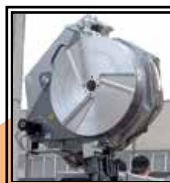
Hydraulic Milling cutter