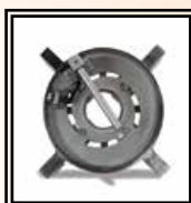
Tool for flange necks