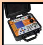
The INSPECTOR Data-logging