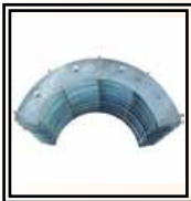
Inserts Ø 200 ÷ 450 mm