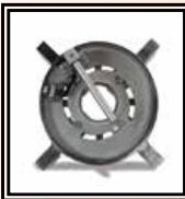
Tool for flange necks