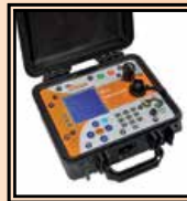
The INSPECTOR Data-logging