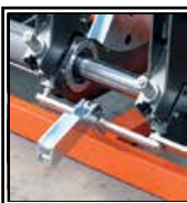
Detach device for heater