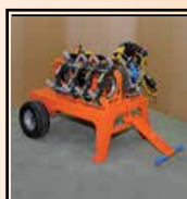
Trolley for machine body