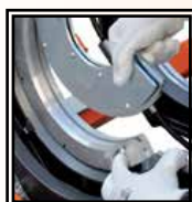
Inserts Ø 75 ÷ 225 mm