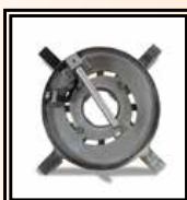
Tool for flange necks