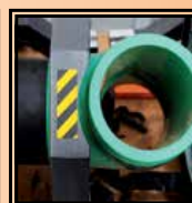
Top Clamp Short Elbows/Tee