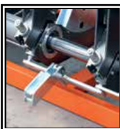
Detach device for heater