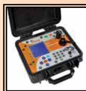
The INSPECTOR Data-logging