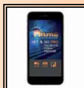
App "Set & Go Pro"