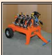
Trolley for machine body