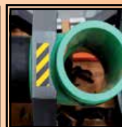
Top Clamp Short Elbows/Tee