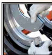
Inserts Ø 75 ÷ 225 mm