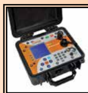
The INSPECTOR Data-logging