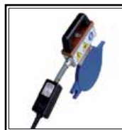
Heating plate with Digital Dragon