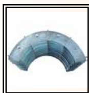
Inserts Ø 63 ÷ 180 mm