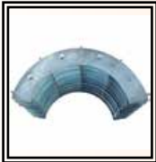
Inserts Ø 63 ÷ 180 mm