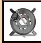
Tool for flange necks

and: Inserts Ø 2" ÷ 6" IPS; 3" ÷ 6" DIPS pre-insulated bag for heating plate