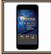
App "Set & Go Pro"